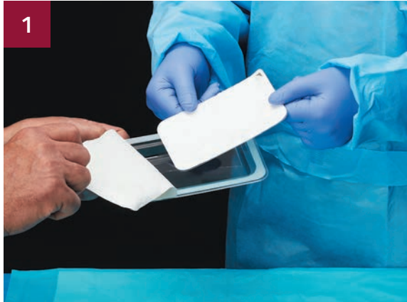
1 Peel back the lid of the outer tray using aseptic technique and present the inner tray with the strip to the sterile field.