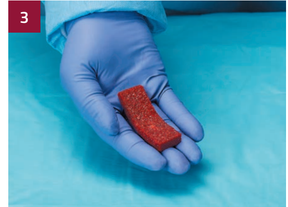
3 Opus BA Strip is pliable and ready to implant once hydrated.

Please visit Orthofix.com/IFU for full information on indications for use, contraindications, warnings, precautions, adverse reactions information and sterilization.