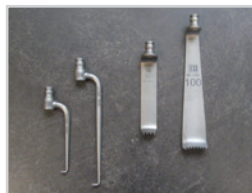
Multiple Blade Options