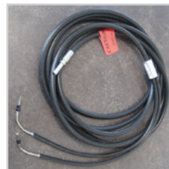
Low Temperature Light Source