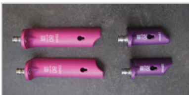
50mm to 120mm Aluminium Blades